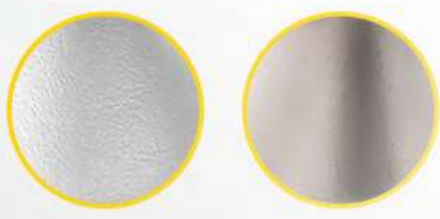
Optional 304 S.S / Tin-nickel Plated