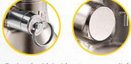
Optional with/ without pressure relief