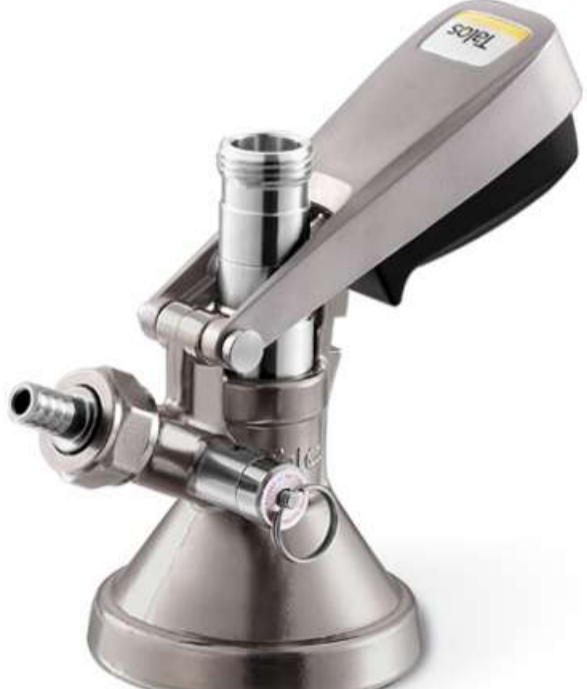
PART NO.: 1027701 Tin-nickel Brass Body, 304 S.S Probe With Pressure Relief Valve