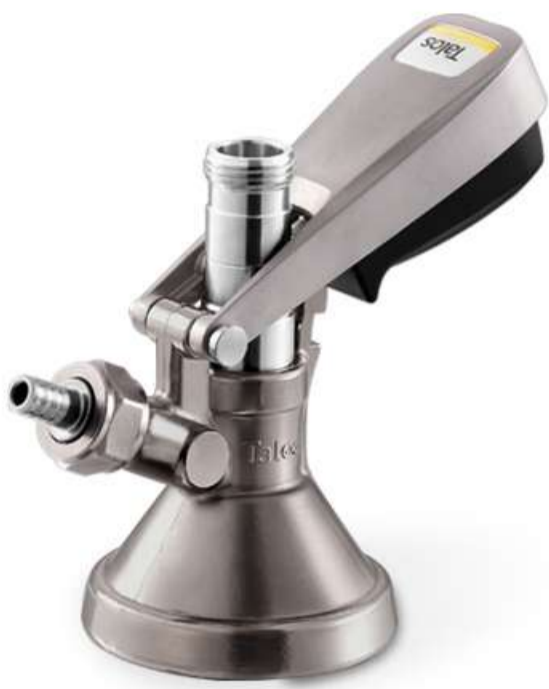
PART NO.: 1027718 Tin-nickel Brass Body, 304 S.S Probe Without Pressure Relief Valve