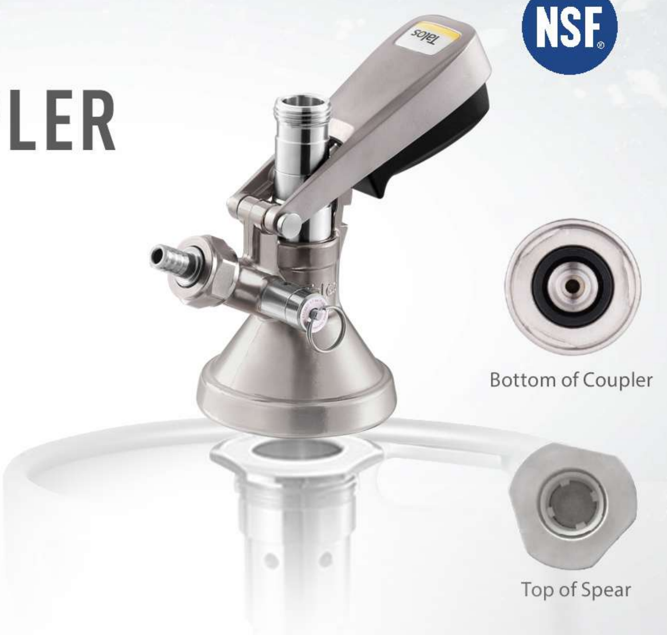
Bottom of Coupler